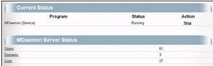
Figure 1 —Global Administrator Status Page

The first screen displayed when you sign in to WebAdmin is the Status Page. For Global Administrators, this screen (see Figure 1) contains the status and a summary of each program WebAdmin is administering. It displays: